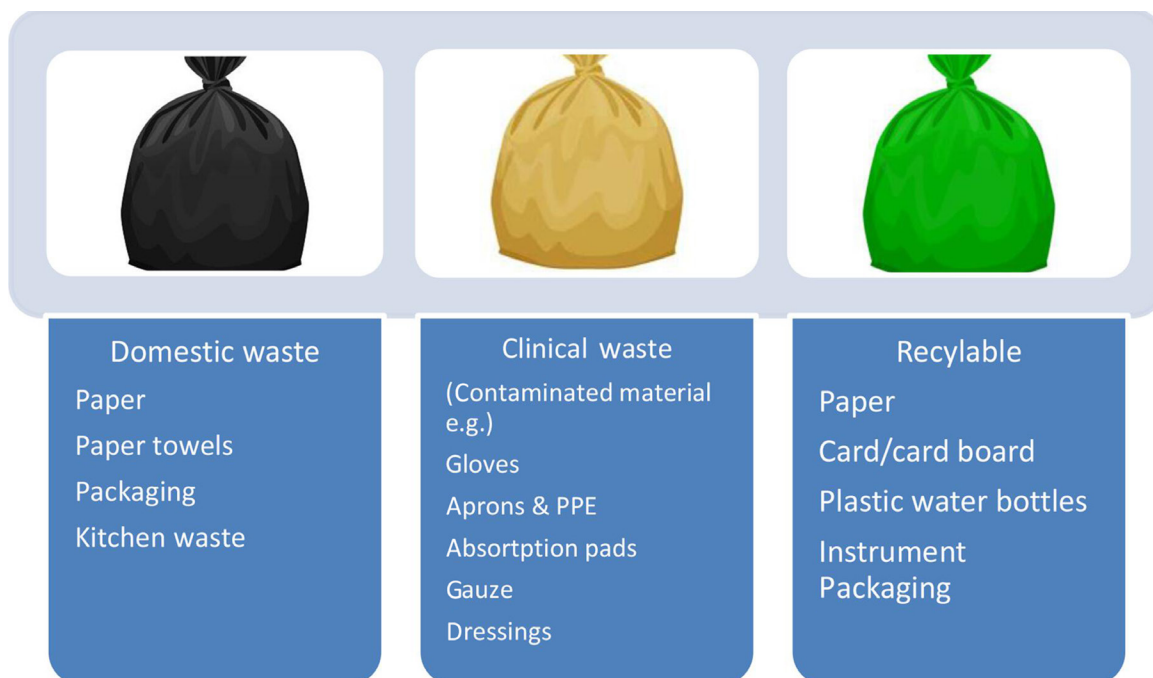
Figure 1 Examples of sorting waste streams (depending on local policy). PPE, personal protective equipment.

legislation involving recycling of contaminated medical waste. 12