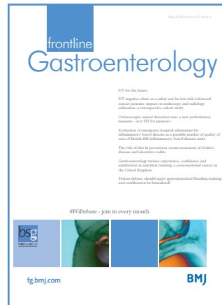
Cover image Colonic polyp, double contrast coloured barium x-ray.

241 Maintaining remission in Crohn’s disease post surgery: what can we learn from Cochrane? M Gordon