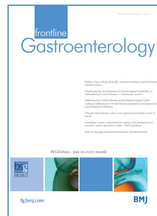
Cover image Colonic polyp, double contrast coloured barium x-ray.