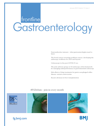
Cover image Colonic polyp, double contrast coloured barium x-ray.