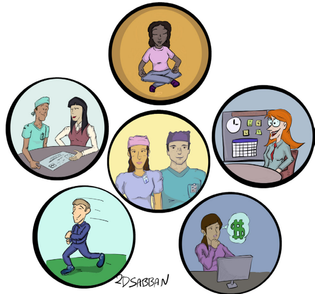
Figure 1 Image illustrated by Abdulhameed Al-Sabban.

At the individual level, it is critical to have both self-awareness to recognise burn-out and self-compassion at this time. We can learn from our individual triggers