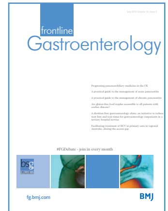
Cover image Colonic polyp, double contrast coloured barium x-ray.