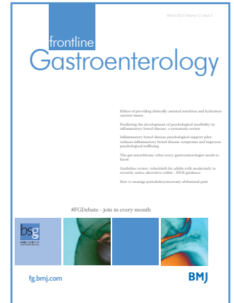
Cover image Colonic polyp, double contrast coloured barium x-ray.