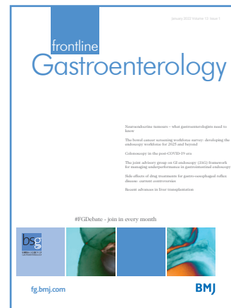
Cover image Colonic polyp, double contrast coloured barium x-ray.