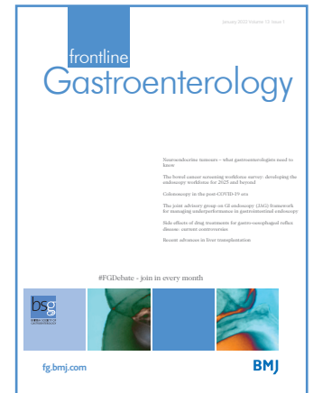
Cover image Colonic polyp, double contrast coloured barium x-ray.