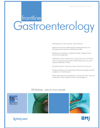
Cover image Colonic polyp, double contrast coloured barium x-ray.

436 EASL clinical practice guidelines: non-invasive liver tests for evaluation of liver disease severity and prognosis A J Archer, K J Belfield, J G Orr, F H Gordon, K WM Abeysekera