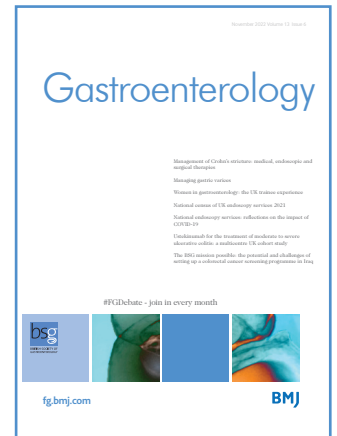
Cover image Colonic polyp, double contrast coloured barium x-ray.