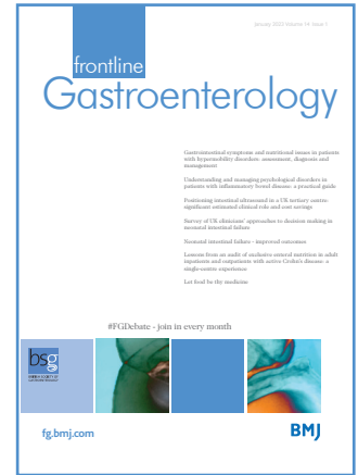
Cover image Colonic polyp, double contrast coloured barium x-ray.