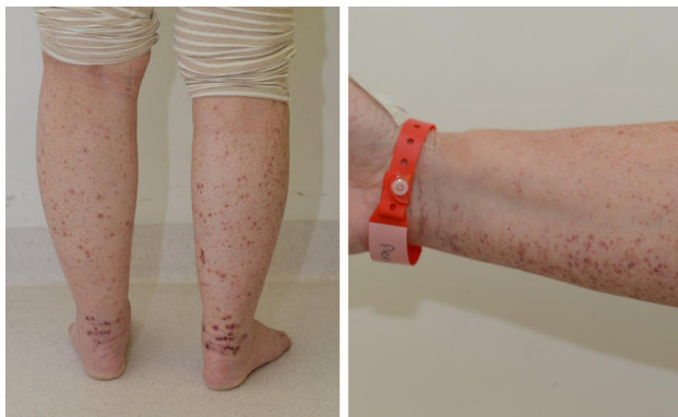
Figure 1 Medical photography of purpuric rash affecting the limbs.

Histological description of skin biopsies is consistent with leucocytoclastic vasculitis, which is diagnostic of IgA vasculitis (formerly known as Henoch-Schönlein