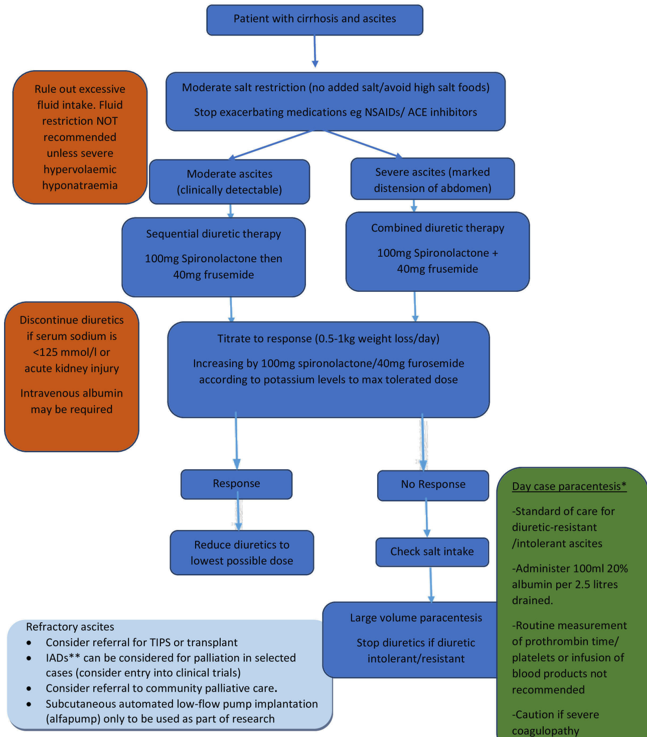
Figure 3 Management approach to the patient with cirrhosis and ascites. *A large volume paracentesis safety toolkit is available from BSG https://www.bsg.org.uk/clinical-resource/large-volume-paracentesis-in-cirrhosis-safety-toolkit/ . **IADs Indwelling abdominal drains. NSAID, non-steroidal anti-inflammatory drug; TIPSS, transjugular intrahepatic portosystemic shunting.

to determine the presence and severity of malnutrition and sarcopenia, both of which are independent predictors of poor outcomes in cirrhosis. 37 While outpatient dietetic services are not widespread for patients with cirrhosis, intervention to prevent/treat malnutrition is important, as its presence is associated with increased decompensation, hospitalisation and mortality. 37