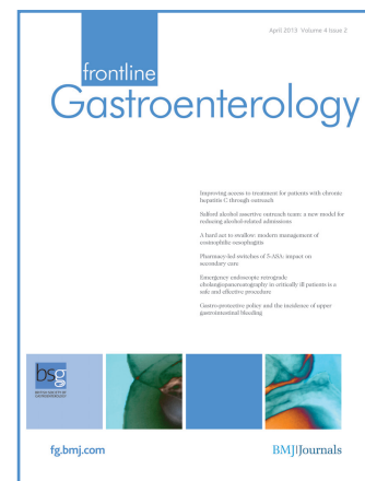
Cover image Colonic polyp, double contrast coloured barium x-ray.