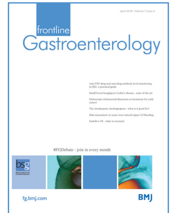
Cover image Colonic polyp, double contrast coloured barium x-ray.