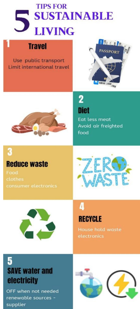
Figure 2 Tips for sustainable living.

the host city. Similar work needs to be undertaken to understand the broadest environmental impact of running a medical conference, with a focus on carbon hotspots. The BSG performed a sustainability analysis of their Live conference in 2023 (internal report). During the event, the caterer calculated the carbon emissions for the food served. Due to the use of local small-sized and medium-sized enterprises, the average kg CO 2 e for meals was 0.5, compared with 1.6 for the UK average. The majority of portions served were in the lowest brackets of CO 2 e. Other aspects of medical conferences that would benefit from a formal assessment of the carbon footprint include the giveaway materials provided by exhibitors.